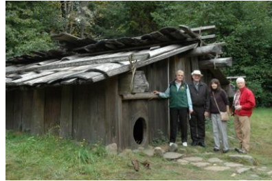
Sumeg Village Plank House