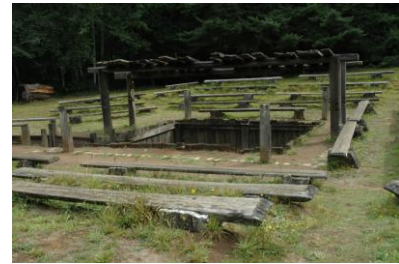
Sumeg Village Dance Pit

The highlight of the museum tour was the Native American Collection from Northwest California tribes. It is no wonder that the Smithsonian is covetous. The Native American basket collection is extensive. Baskets were essential to the everyday life of the Native Americans. Pottery was not in use. Baskets were used for a variety of purposes: cooking, carrying, storage, winnowing, hopper for grinding, hats, eel traps, etc. Cooking baskets were very tightly woven using materials such as willow that swells to hold water. The outside of the baskets were decorated in tribal designs using collected materials. Other available materials were used for daily use. Mussel shells were used by woman as spoons; men's spoons were carved from wood. Dentalia shells from British Columbia were trade currency. Tools were made from stone such as chert, sourced in Oregon and obsidian probably sourced from Mount Lassen.