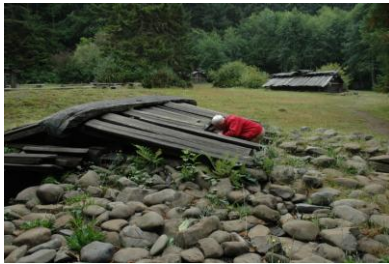
Sumeg Village Sweat House