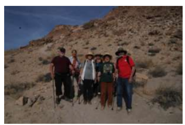
Skyrock – start hike