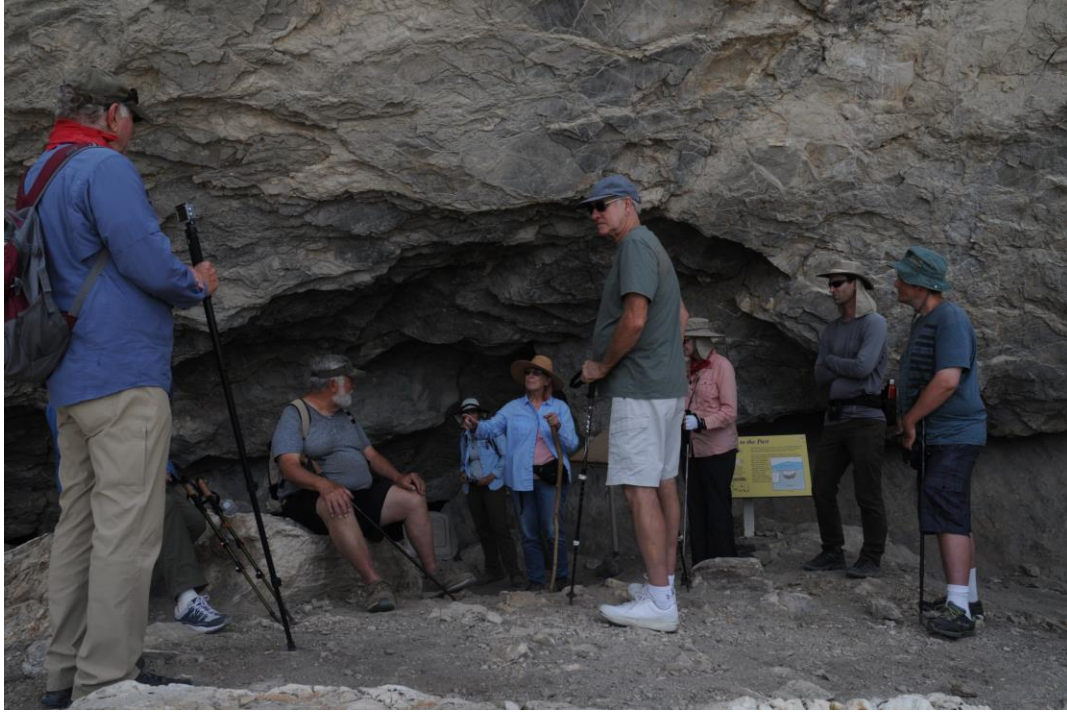
Figure 8 Lovelock Cave