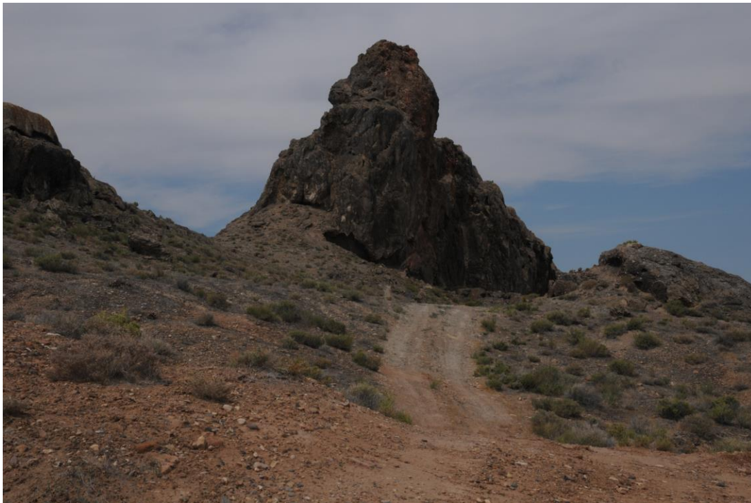
Figure 8 Leonard Rock Shelter