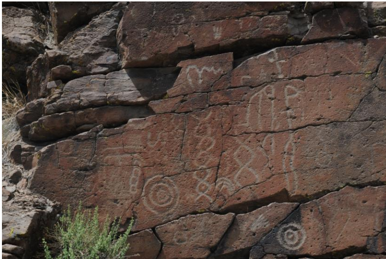
Figure 1 Rock art at Griffith Canyon