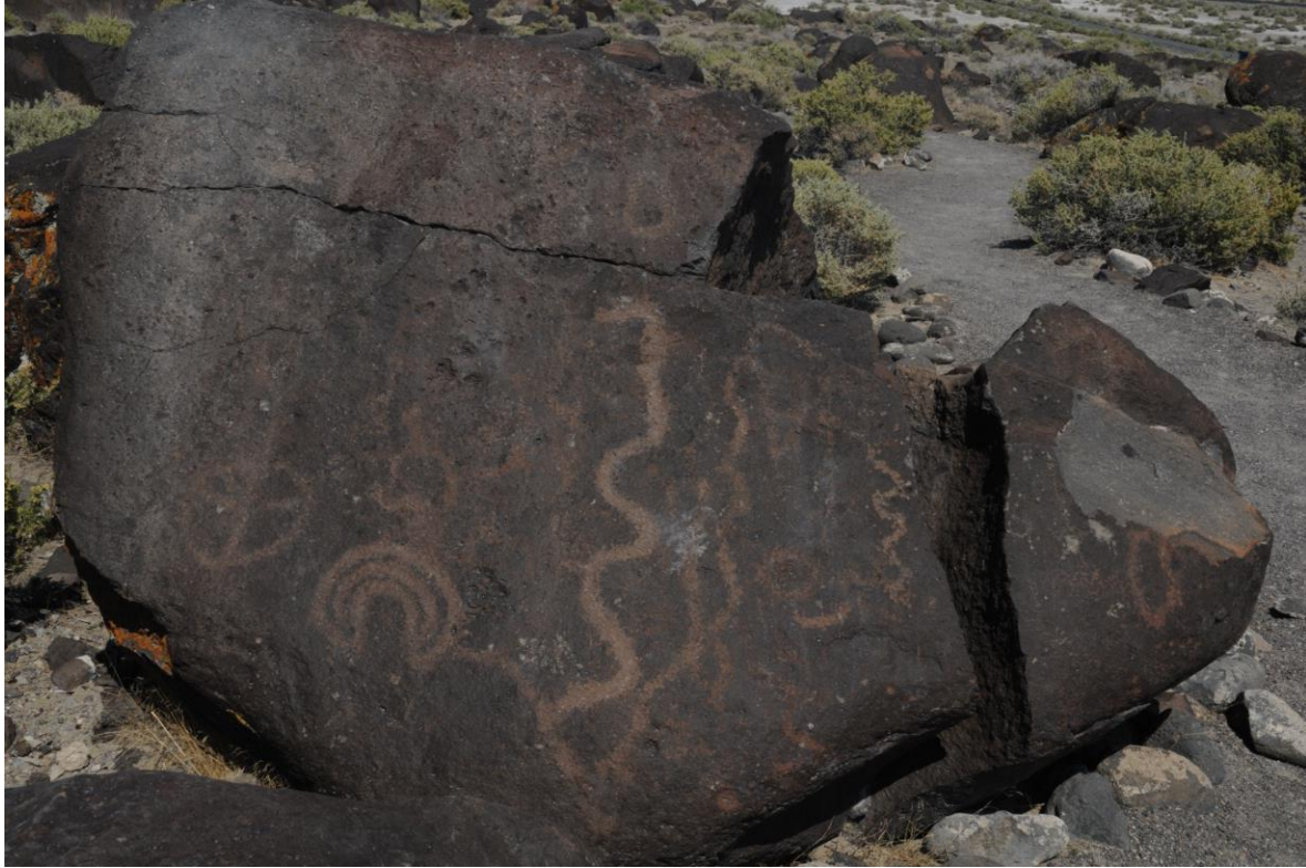
Figure 3 Grimes Point boulder with petroglyphs