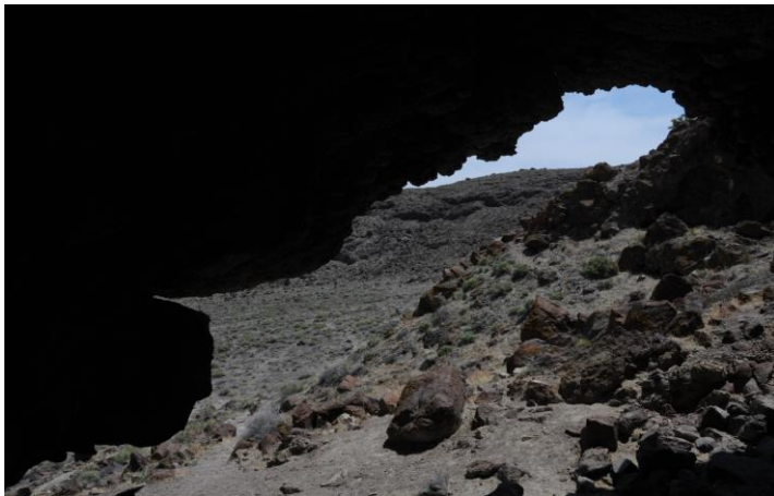
Figure 6 Looking at landscape from Picnic Cave

On the final day near Lovelock, John Foster and Dan Foster led the group to Lovelock Cave and offered historical perspective. After going inside the cave and enjoying the geology of the area a segment of the group went to Leonard Rock shelter. There they were pleased to see the beauty of nature in a tufa shelter and find rock art. All in all, the group ended the tour with expanded insight into the geological and cultural history of the area.