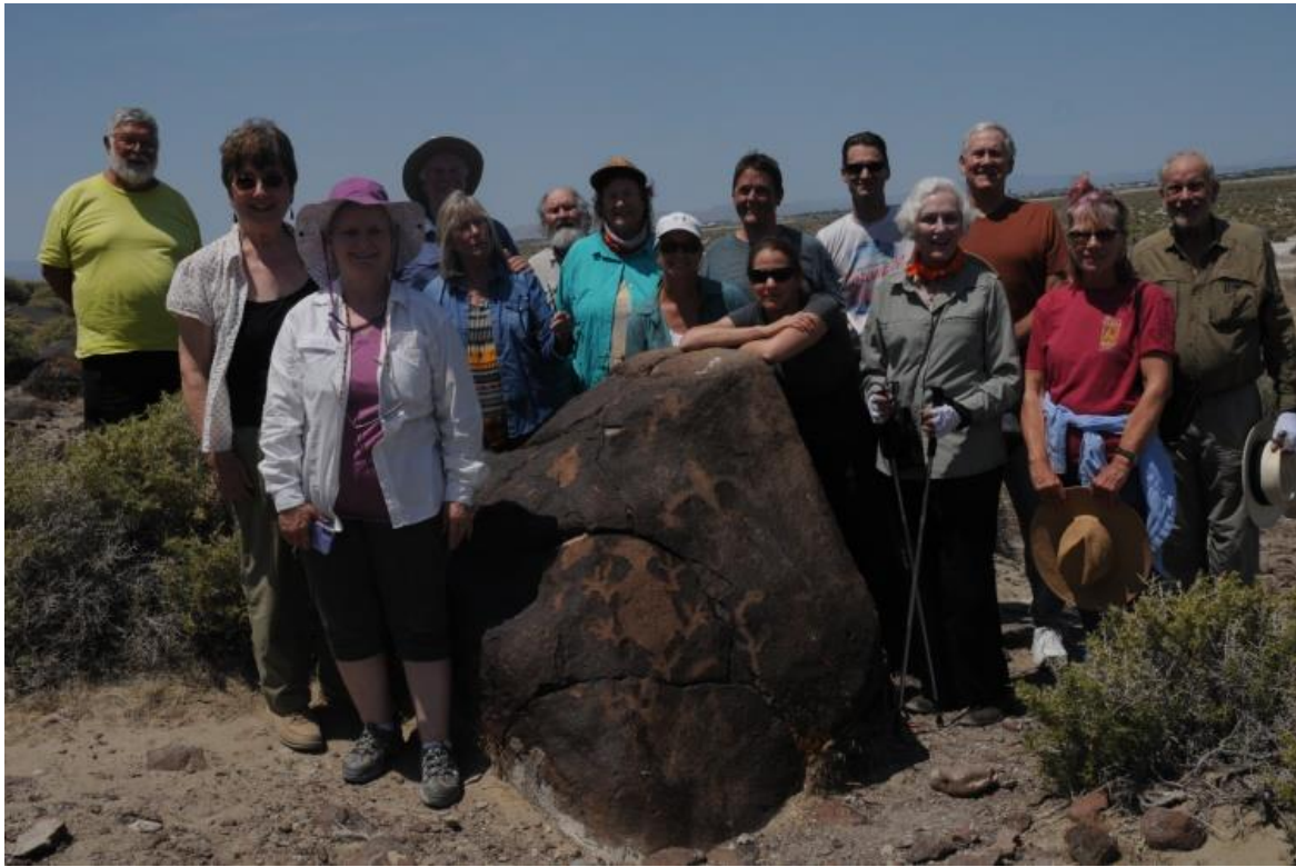
Figure 5 Group at Lizard Rock near Burnt Cave & Picnic Cave