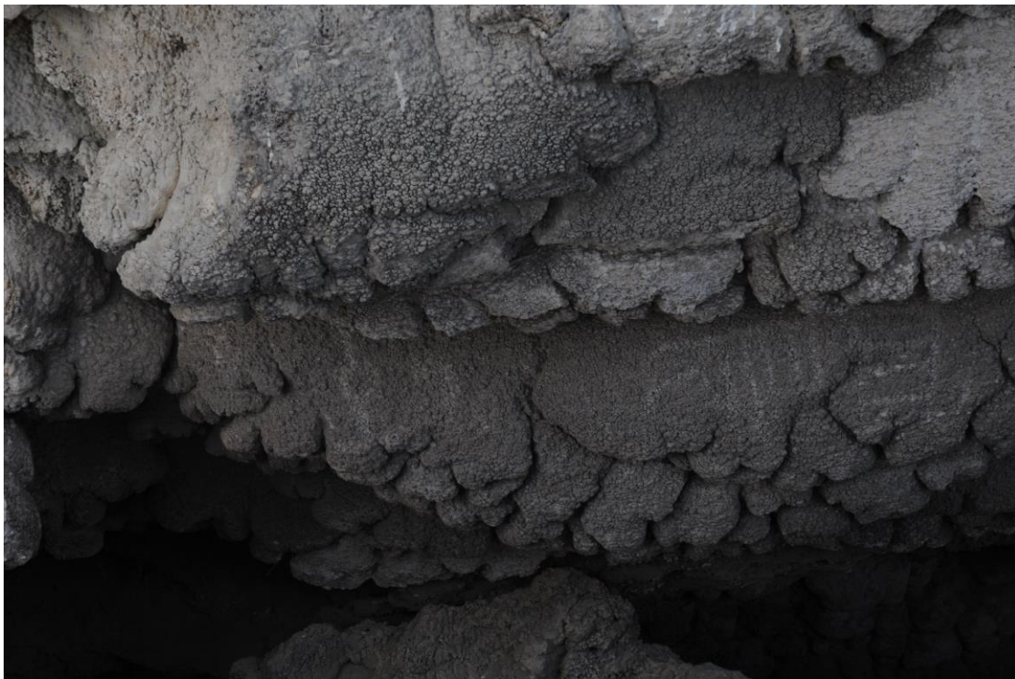
Figure 101 Tufa and Rock Art