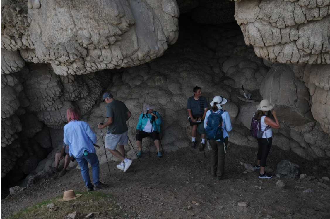
Figure 9 Group in Leonard Rock Shelter