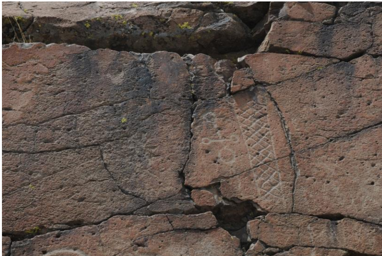
Figure 2 Rock art at Griffith Canyon