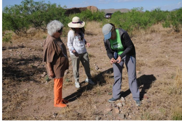
Convento Site searching for sherds