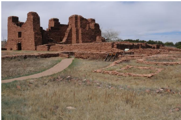
Quarai Church and Pueblos