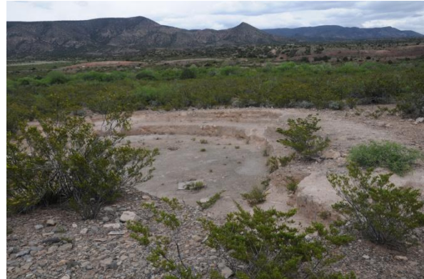
Creek side kiva