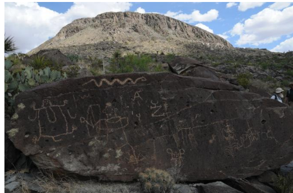
Alamo Mountain with rock art