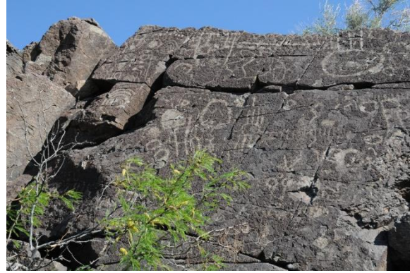
Willow Springs Panel