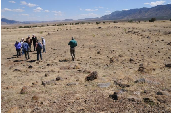
Site 242 Ball Court