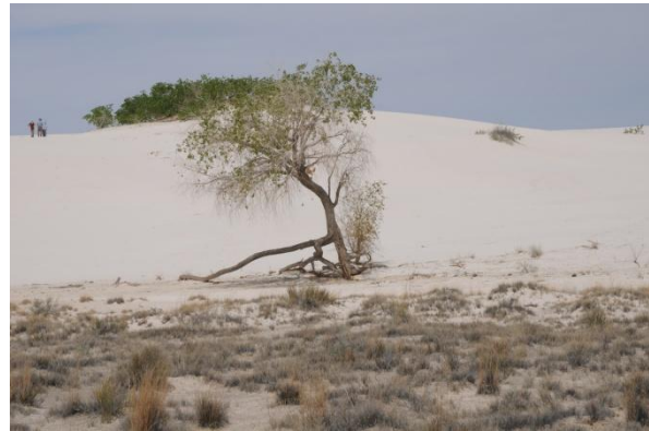
White Sands Cottonwood