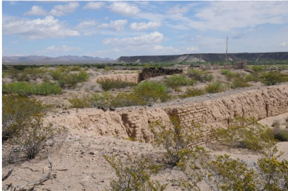
Fort Craig Ramparts