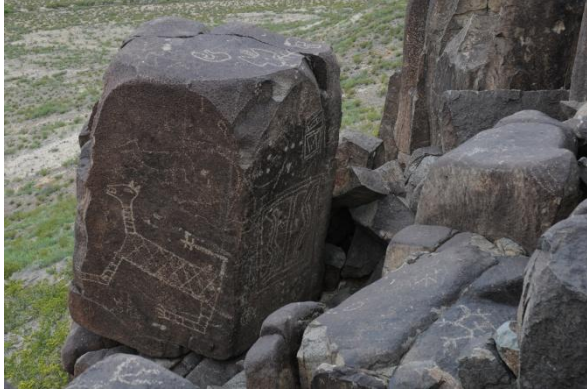
Three Rivers Long Necked Cat