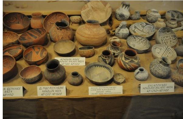
Mogollon pots at Geronimo Springs Museum