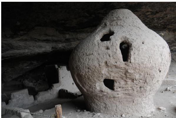
Cueva de la Olla