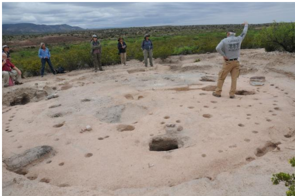
Creek side excavation of pit house