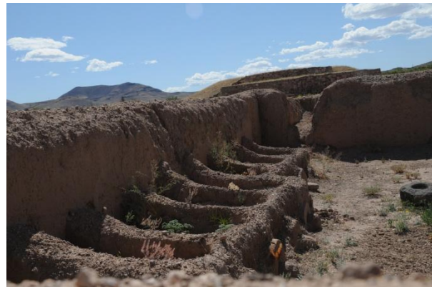
Paquimé Macaw Pens